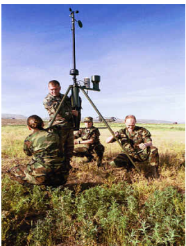
Working with tactical equipment in the field is just one small part of the weather career

Have you ever wondered how hurricanes form? Why are tornadoes so difficult to predict? These are just a few of the questions that you will be able to answer if you choose to pursue a weather career in the Air National Guard