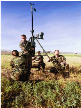
Working with tactical equipment in the field is just one small part of the weather career

Have you ever wondered how hurricanes form? Why are tornadoes so difficult to predict? These are just a few of the questions that you will be able to answer if you choose to pursue a weather career in the Air National Guard