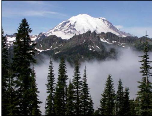
Sweeping views of Mount Rainier is a common backdrop to the 116 th Weather Flight